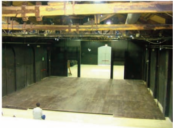
Sala A: the stage