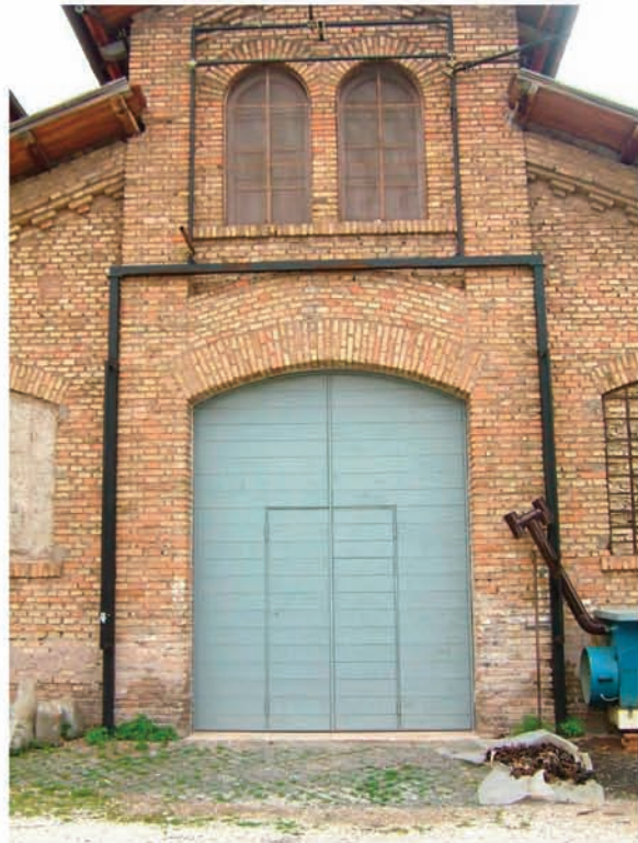
Sala B: Unloading door