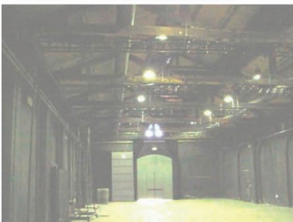
Sala B: the trusses