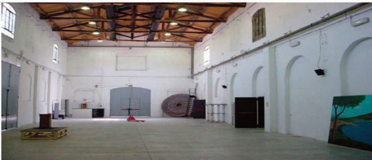
Teatro India: Foyer