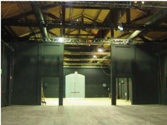
Sala A: the stage