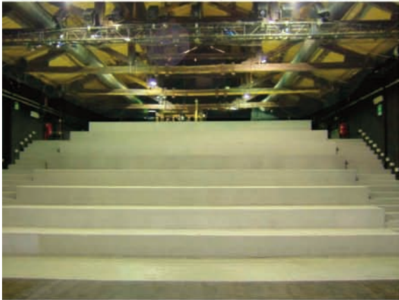
Sala A: the gallery