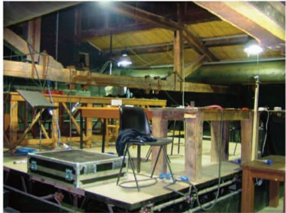
Sala A: light and sound control place