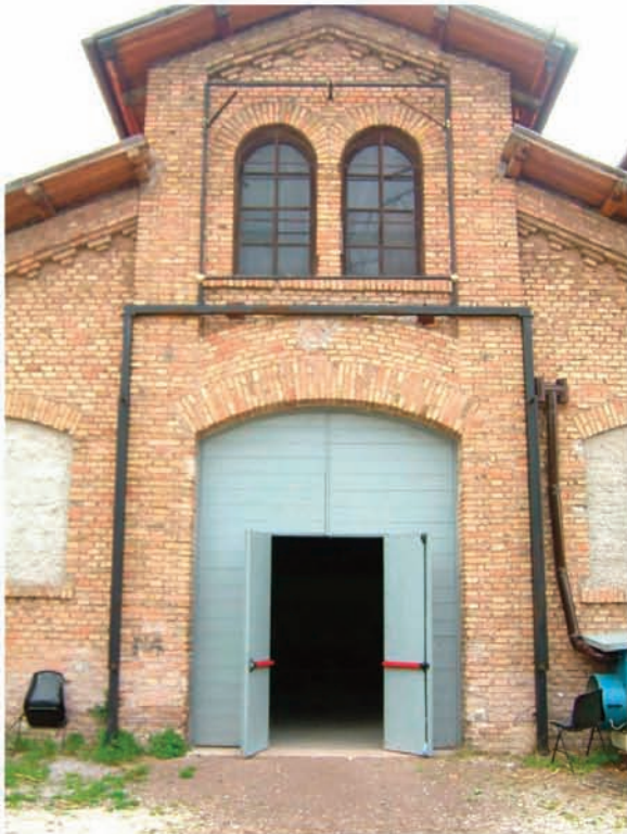
Sala A: Unloading door

Loading docks: Unloading doors: Width: 2.84 m Height: 3.30 m