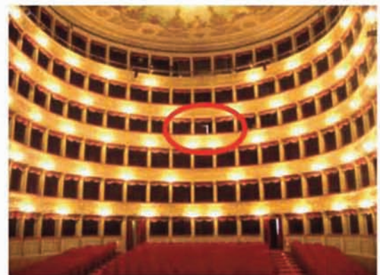
Teatro Argentina: L. and S. control boxes