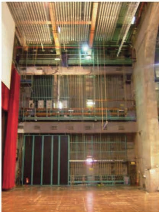
Teatro Argentina: Stage left