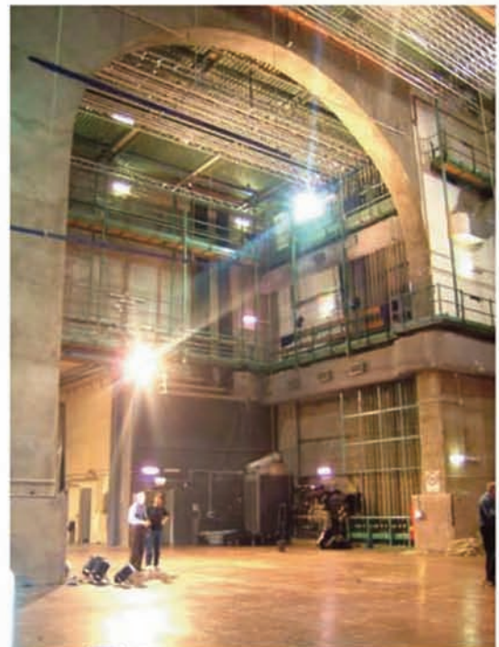
Teatro Argentina: The arch