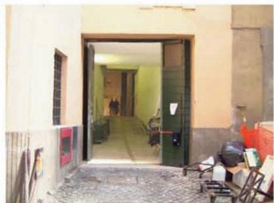
Teatro Argentina: Unloading corridor