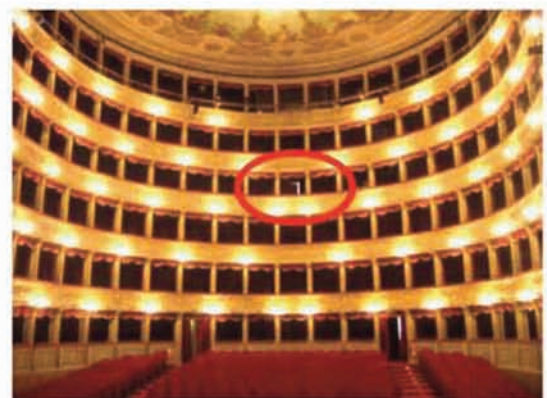
Teatro Argentina: L. and S. control boxes