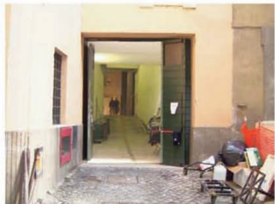
Teatro Argentina: Unloading corridor