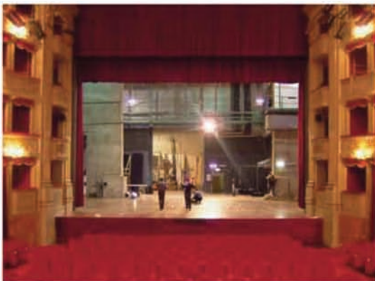
Teatro Argentina: the stage

House curtain: electrical; red velvet Legs: 10 - Black velvet 04 m x 10 m Back drop: 1 - Black velvet 10 m x 16 m Borders: 5 - Black velvet 03 m x 16 m Stage level: 1.05 m Floor: Wood Trapdoors: 211 – 01 m x 01 m each Height under the stage: 2,20 m Stage thickness : 6,0 cm