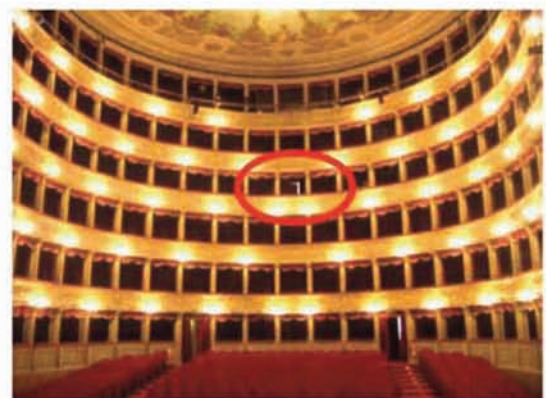
Teatro Argentina: L. and S. control boxes