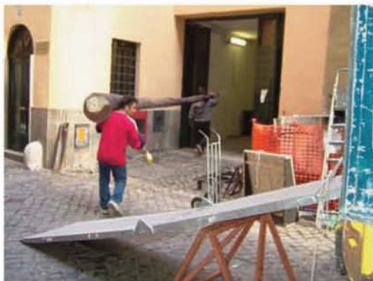
Teatro Argentina: Unloading door

Corridor to the stage: 20.0 m – no stairs